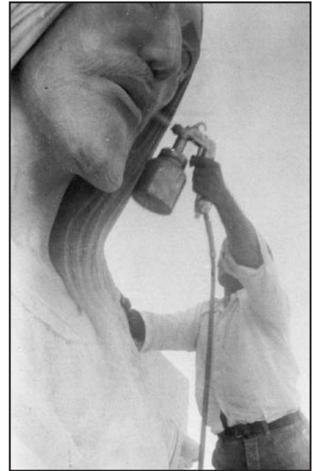
Urbici Soler at work on statue in 1939.

Soler, who created more than 143 works worldwide, also originally intended for a crown to surround the sculpture, according to Daniggelis but this vision was not realized until long after the sculptor’s death.